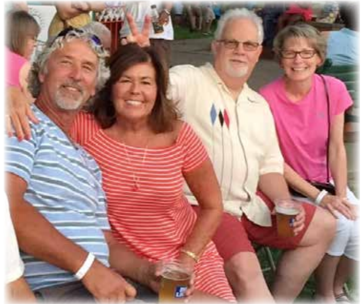
The Deers & the Tiltions