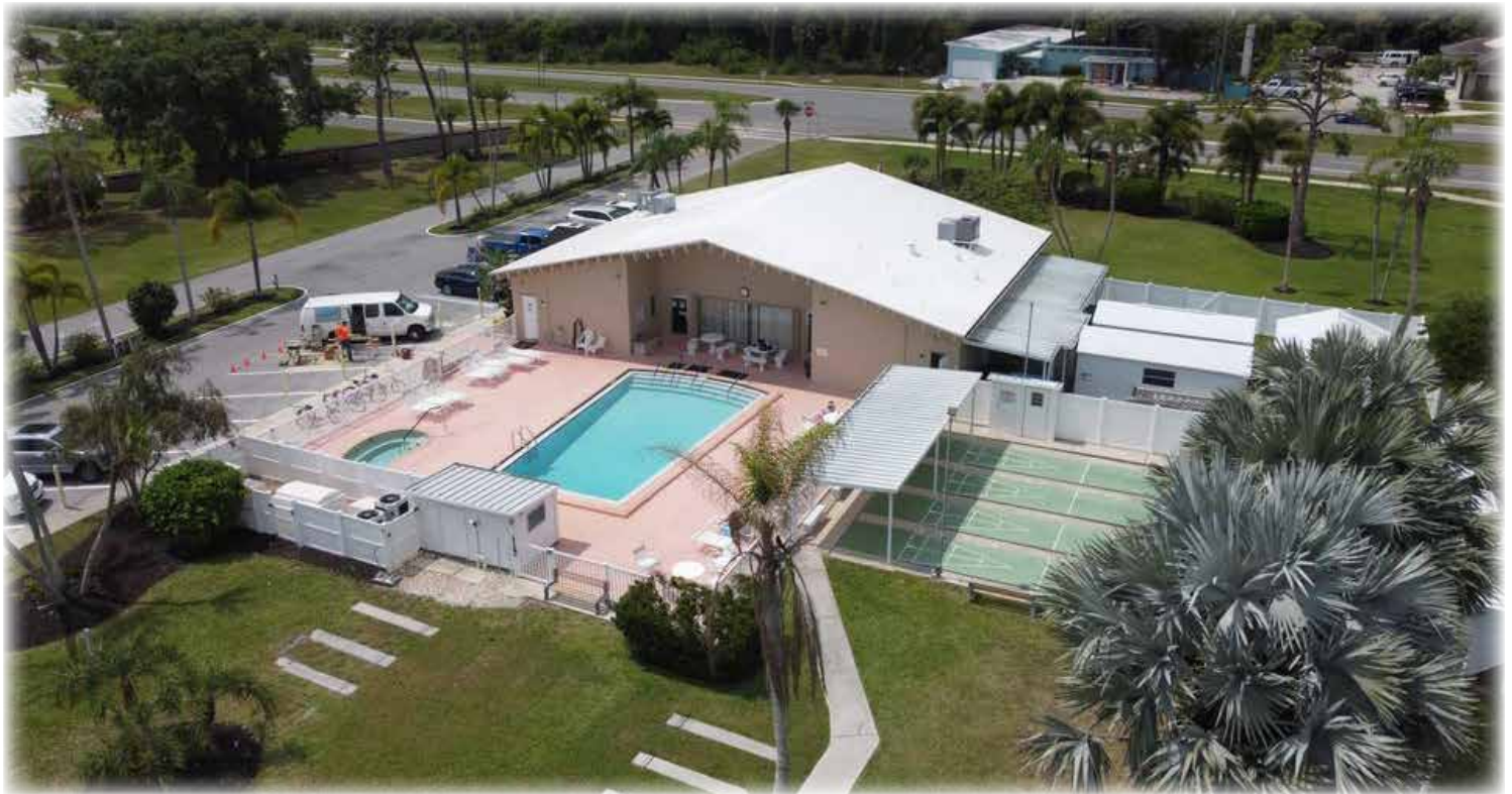
Venetian Park Estates From The Air