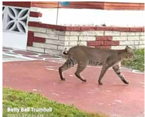
Bobcat on Gondola