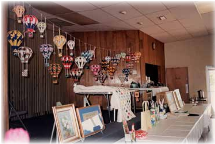
March 1989 Spring Luncheon & Craft Show- showcasing our talent here at VPE.