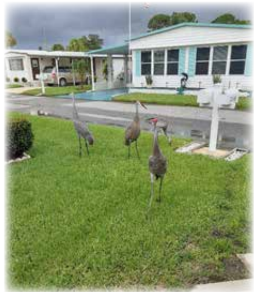
Another Reason to Live in Paradise