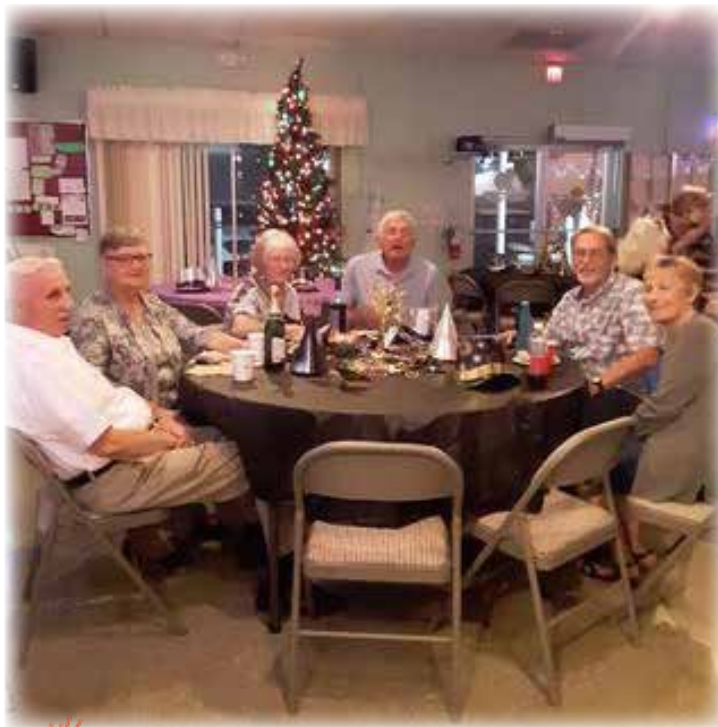
Ring in the New Year